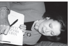
Mary Higgins Clark Book Signing Event