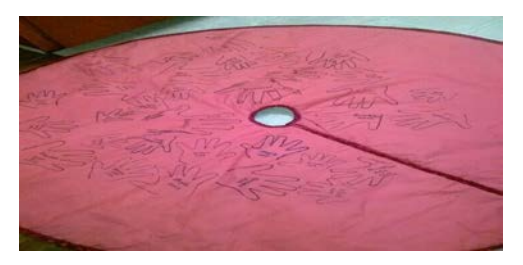
Your hand collage will continue to grow the longer you have it.

You might not realize how quickly your brothers and sisters have grown since they were born. Make a hand collage of your family to chart how it happens. Have all of the members of your family trace their hands on a sheet of poster paper. Everyone can then write their name on the palm of their hand and the date on one of their fingers. Every few months, draw a new hand and repeat the process. Watch as your hand collage gets bigger and bigger.