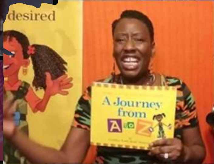
A Journey from