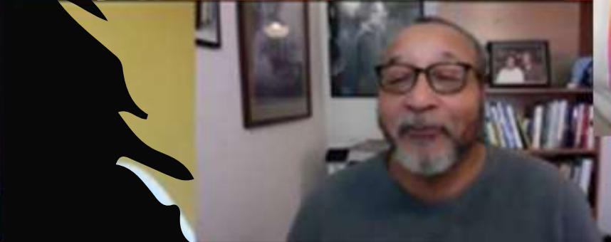
Webster - Institute of Jazz Studies