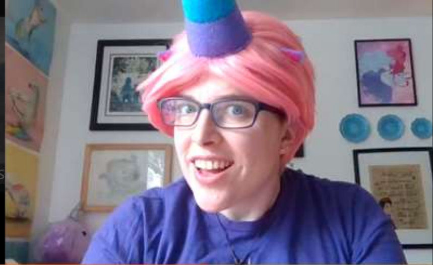
Ny - S