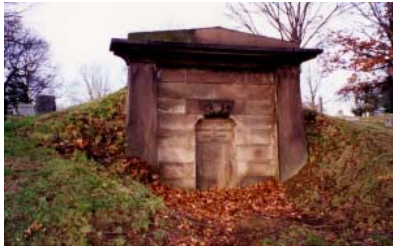
The Egyptian-style mausoleum of the Van Buskirk and Jaques families in Evergreen Cemetery is built into the side of a hill.