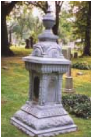
The Cetchius Family headstone is unique because of its tin construction. Mt. Pleasant Cemetery.