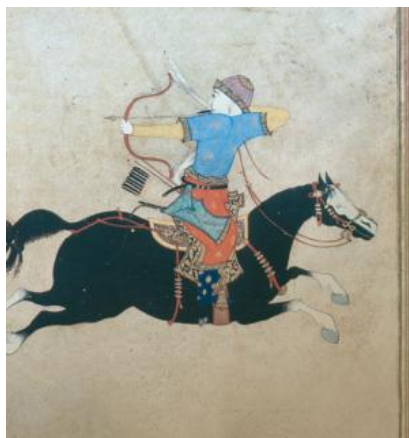
Turkish horseman drawing his bow, 15th-century Ottoman miniature

The Newark Public Library is honored to be a venue for the traveling exhibit, Poetic Voices of the Muslim World .