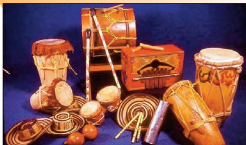
Traditional percussion instruments from Columbia.

Bomba and plena are two signature genres of Puerto Rican music. Bomba originated among enslaved Africans, and plena in the coastal urban centers. The celebrated percussion and dance ensemble, Segunda Quimbamba , brings history to life with its performance, and discusses the origins and structure of the two percussion-driven musical traditions.