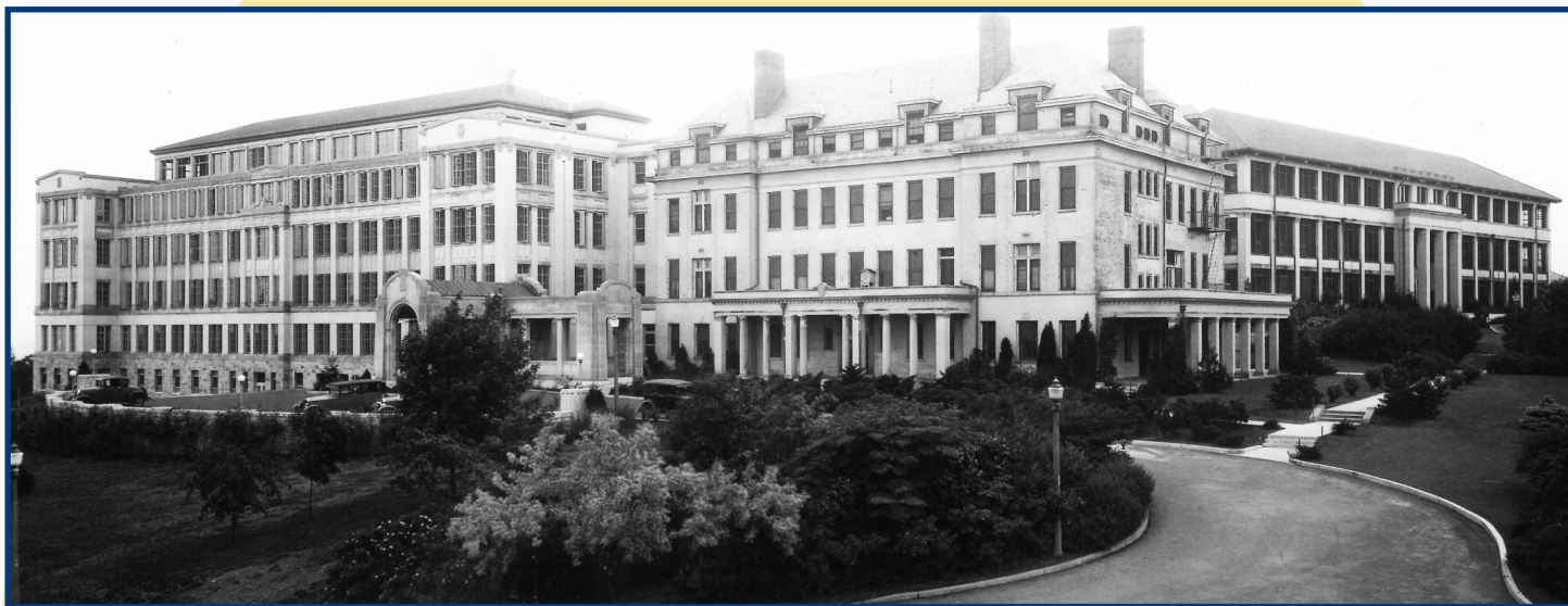
Essex Mountain Sanatorium in 1933.