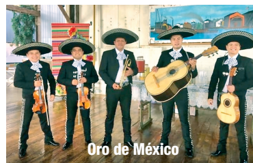
Oro de México