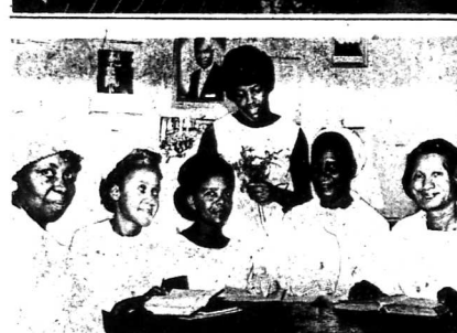
HOLD WOMEN'S DAY - Women's Missionary Society of St. James AME Church Newark, N.J. con-