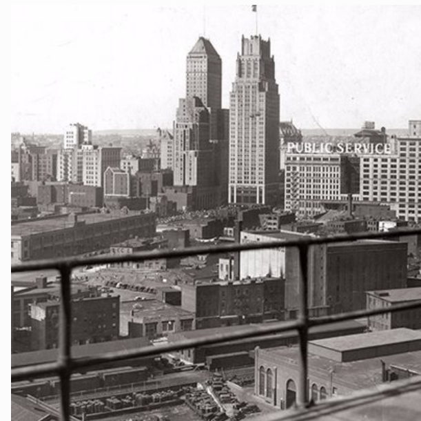
From our collection. Newark panorama.